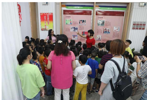
Fig. 3. Children serial books Exhibition