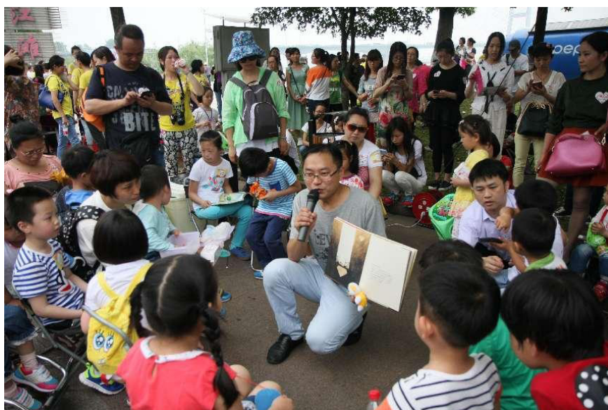
Fig. 5. Picture Book Story Activity