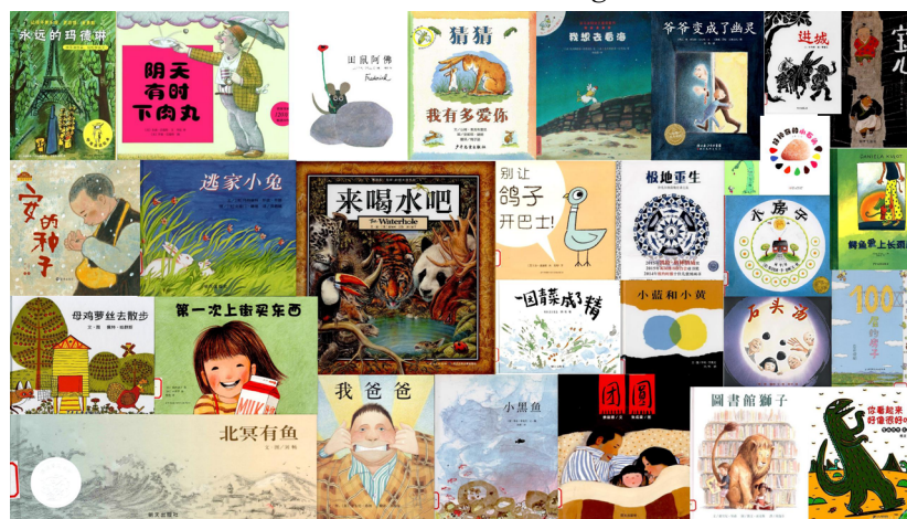
Fig. 4. Picture book

Since 2010 picture books have become the favorite of 7 years old children, resulting in a rise of lending amounts. The library purchasing department works closely with the book circulation department to track and to satisfy readers' needs.