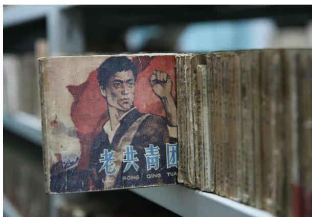
Fig. 2. Children serial book

Based on the application-oriented concept and children's reading needs, our library carried out a dynamic integrated model of book collection. Literary and art books and collections are in high demand in the library.