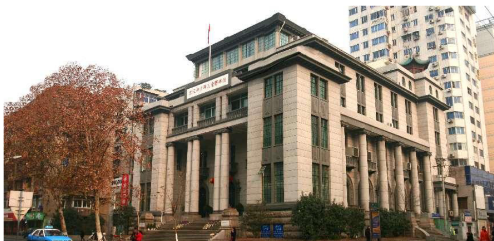
Fig. 1. Wuhan Children's Library

areas. It utilizes book collections for display and research as well as promoting children's reading under the practical concept of “Books Are Designed for Reading”. Not satisfied with the traditional service model of waiting passively for readers to engage with the library, our staff introduces our library more proactively by finding appropriate books for readers and meeting readers' book needs. The use of library books is maximized through the help of the librarians' guiding readers through library services and offering.