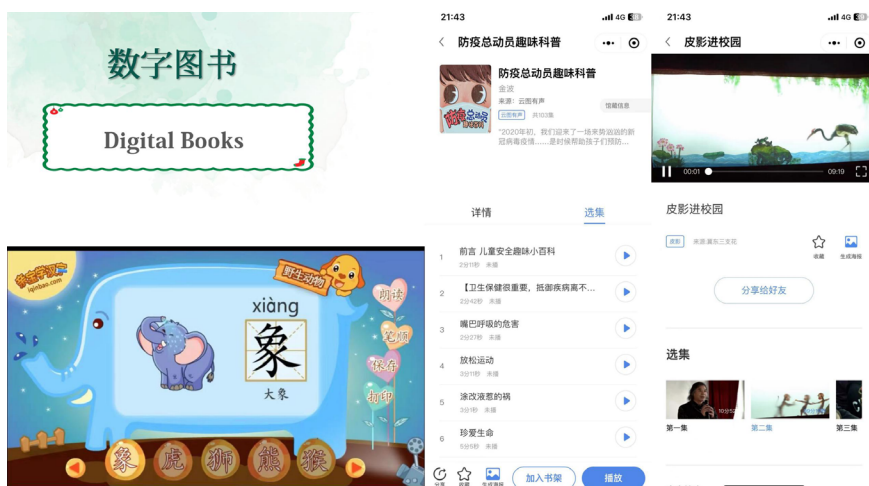
Fig. 6. Digital Books

First, we have established a cooperative relationship to promote books with numbers of producers as children book writers and national children book publishers.